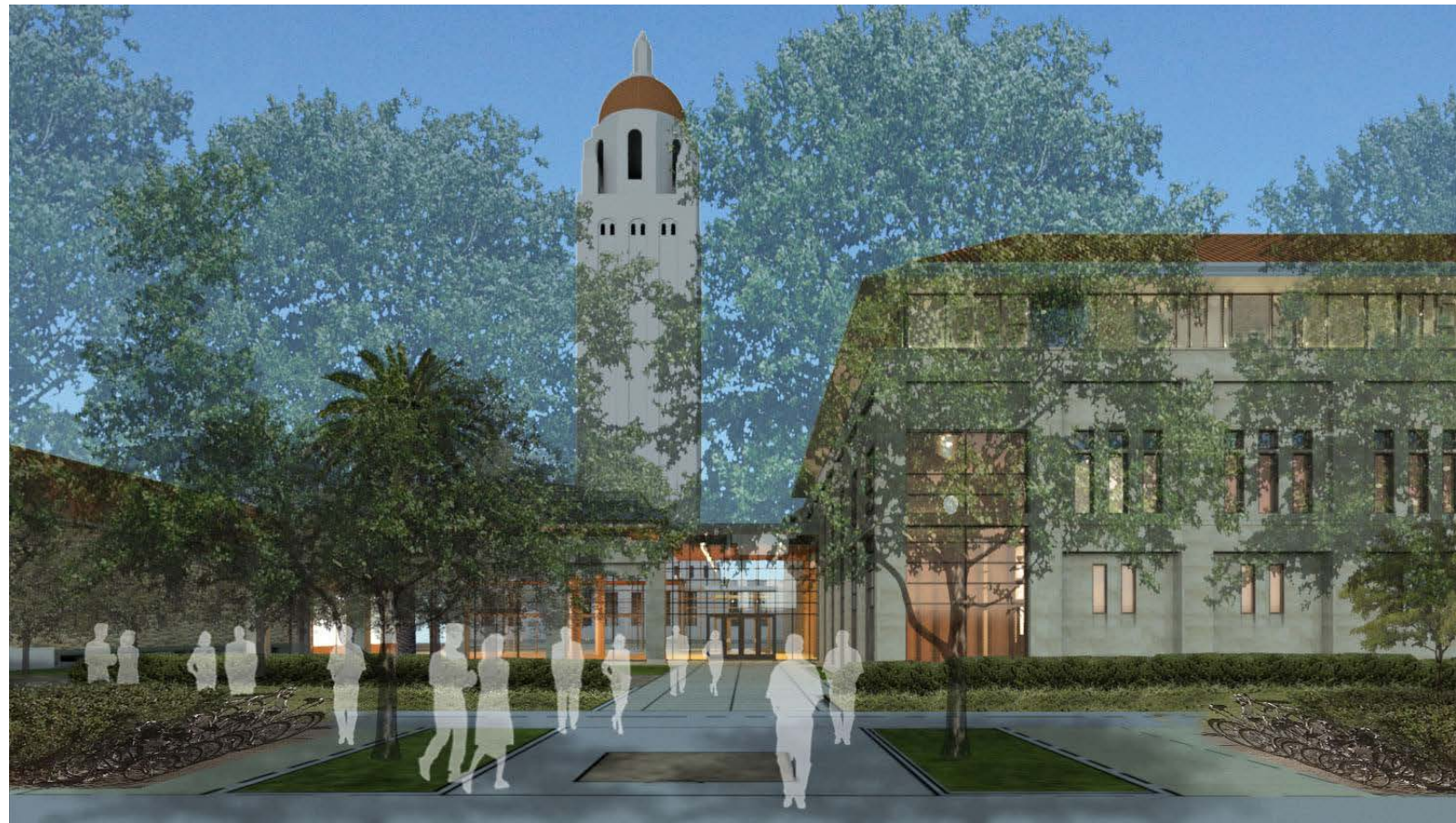
Stanford University Hoover Institution Conference Center and Office Building Stanford, CA

Situated at the base of the iconic Hoover Tower and adjacent to Stanford University's historic main quad, the Hoover Conference Center and Office Building provides a new home for the public policy research center's symposia and donor retreats as well as consolidated offices for the institution's management and operations. The 55,000 square foot building houses a 400 person auditorium and a 440 person dining hall/multi-purpose room with a single-level suite of offices and meeting rooms on the second floor above. A glassy arcade and central pavilion space provide pre-function support for the two main function halls while connecting directly to new outdoor courtyards and the Stanford campus beyond. The project is currently in construction documentation.