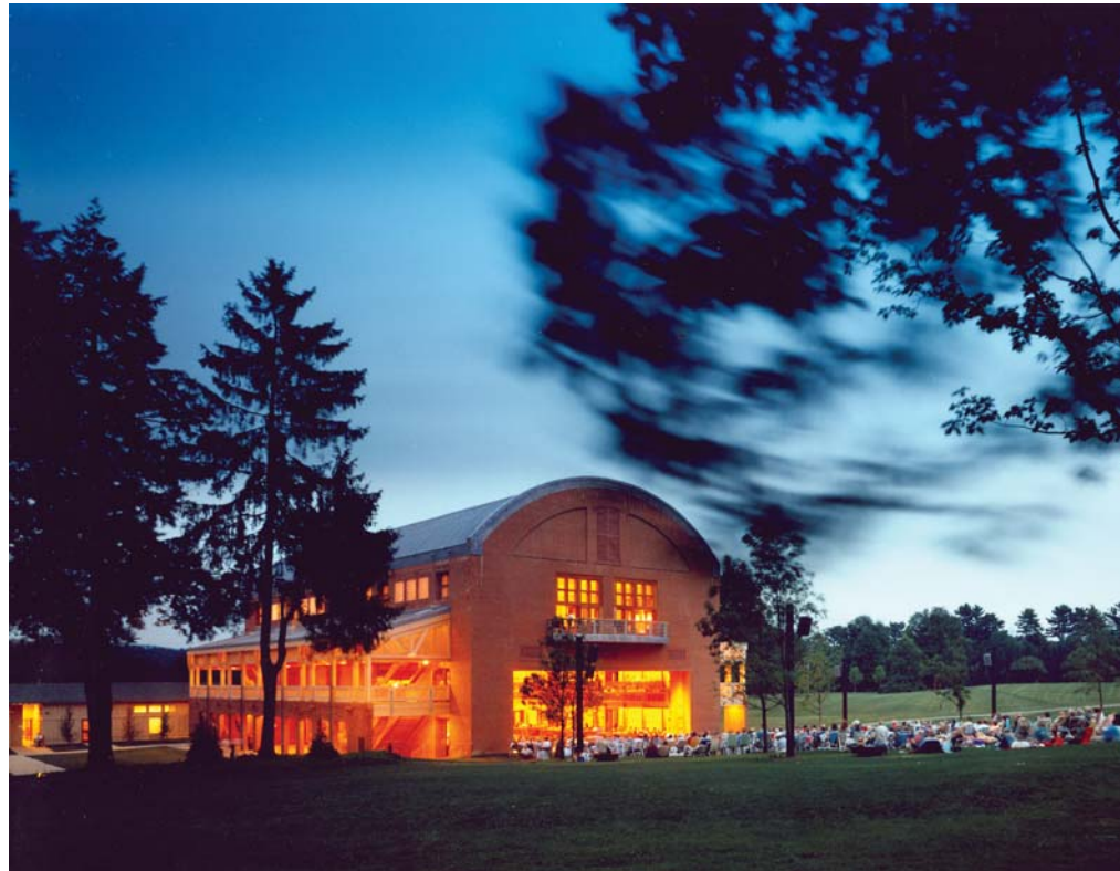
Seiji Ozawa Hall at Tanglewood Lenox, MA