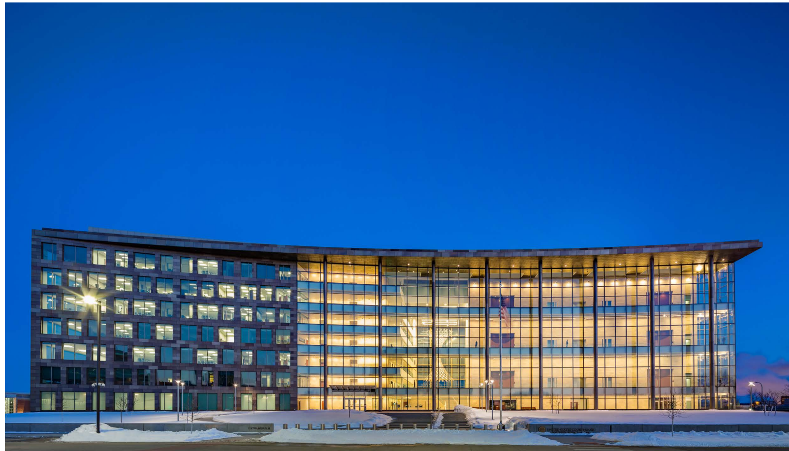
US Courthouse Cedar Rapids, IA

Sited on the Cedar River in Cedar Rapids, IA, this United States District Courthouse brings together for the first time the District, Magistrate, and Bankruptcy Courts, as well as Appellate Court chambers, Probation Services, Congressional offices and the offices of the U.S. Attorney. Like older courthouses, all courtrooms have windows that fill the courtrooms with diffuse daylight. The Courthouse opened to the public on November 6, 2012. The Associate Architect is OPN Architects (300,000 g.s.f.)